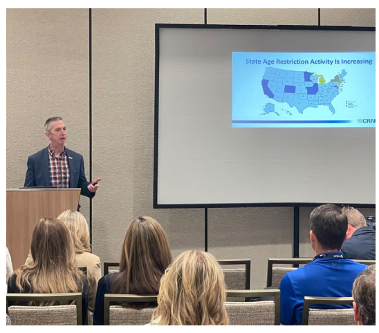
Scenes from CRN's first ever SupplySide West breakfast briefing on the association's efforts to overturn the New York law and to defeat age restriction legislation in other states.