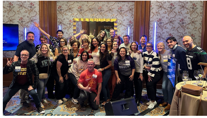
Upper left to bottom: CRN's Legal, Regulatory, and Compliance Forum audience. CRN's Retailer Relations Forum event at NACDS. Attendees unwind together by night at CONVERGENCE '24.