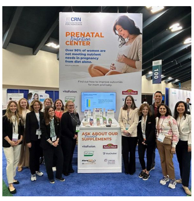
CRN and members at the ACOG Annual Clinic and Scientific Meeting.

A respected reputation isn't just good PR—it's good business. CRN protected and enhanced the credibility of dietary supplements by countering misinformation, promoting science-backed benefits, and highlighting responsible industry leadership. In 2024, the team led high-profile media responses, drove consumer education efforts, and advanced initiatives that showcase the integrity of our members.