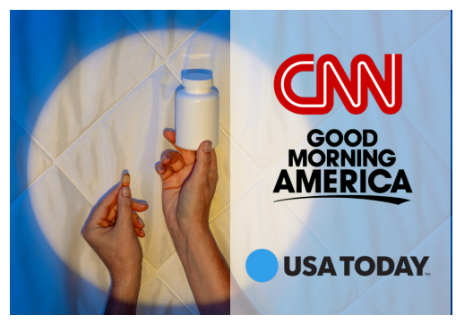
CRN's release of melatonin guidelines was covered by

Smart companies know that strong self-regulation isn't a burden—it's a competitive advantage. In 2024, the CRN team and our members advanced self-regulatory initiatives to reinforce consumer trust, strengthen industry credibility, and safeguard the future of dietary supplements and functional foods. These member-driven voluntary guidelines, best practices, and industry-leading compliance tools set the standard for responsible growth.